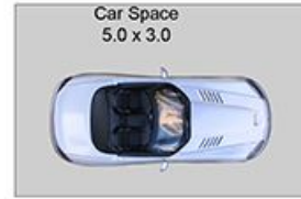
(Not Shown In Actual Location / Orientation)