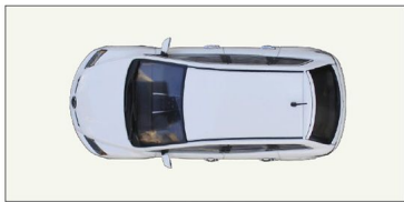
SECURITY CAR SPACE (NOT SHOWN IN ACTUAL LOCATION / ORIENTATION)