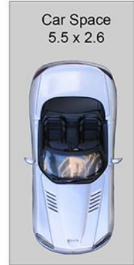
(Not Shown In Actual Location / Orientation)