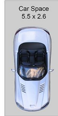
(Not Shown In Actual Location / Orientation)